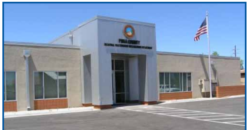
New Conveyance System Administrative Office

The Pima County Facilities Management Department completed the renovation of the former Ilsa's Bakery into an office complex for the Conveyance Division. The Conveyance Division has been housed in a facility located at 3390 Richey Boulevard since 1979 when Pima County received the facility as part of a 1979 intergovernmental agreement (IGA) between Pima County and the City of Tucson. At that time, RWRD was responsible for the operations and maintenance of 1,600 miles of sewer lines.