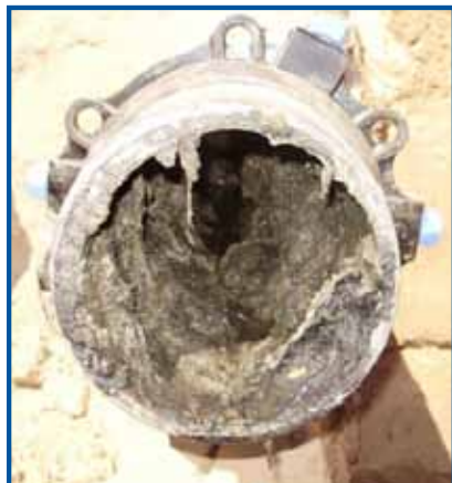
Centrifuge Unit at Ina Road WRF Before Repair Work

An above-ground temporary pipe was used to convey the centrate to the headworks, and there was discussion about constructing a permanent underground centrate line. Initial estimates projected the design engineering costs at $500,000 and construction costs at $4.5 million. Discussion about replacing the line was underway when staff suggested that an attempt be made to 1) clean the line and 2) if successful, install manholes to allow for regular cleaning and maintenance. This suggestion was met with a good deal of skepticism since the likelihood of the line being clogged with struvite was high and removal of significant amounts of struvite would most