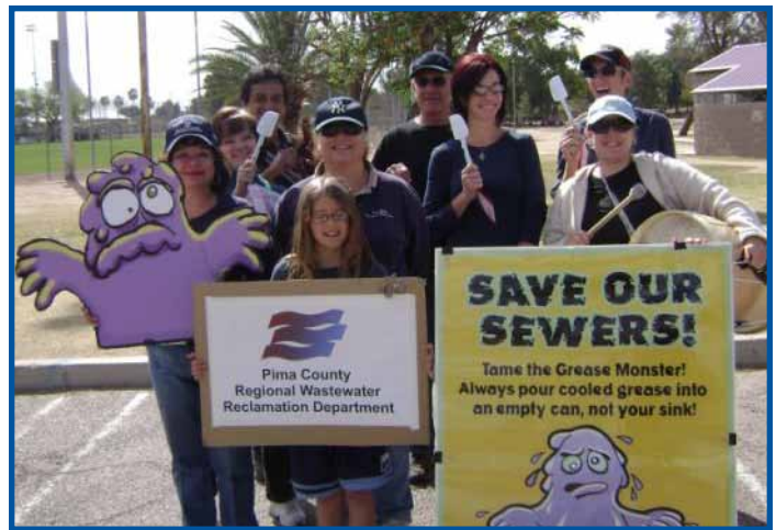
Earth Day Parade Sewer Singers

Parade attendees and judges alike responded with laughter and what appeared to be a "light bulb moment" as the enthusiastic Sewer Singers described in song what happens