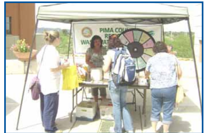
Earth Day at Pima Community College