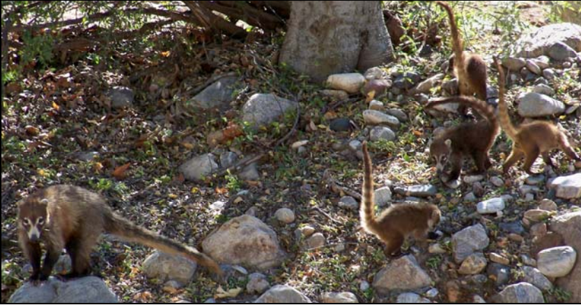
A troupe of coatis, photographed at the 6 Bar Ranch.

The Pima County Public Works Departments have developed a standard operating procedure for buffelgrass removal to coordinate, manage, control the spread of, and eliminate buffelgrass on county rights of way and county owned property.