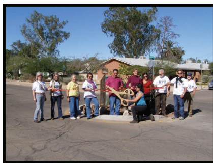
Jefferson Park Ribbon Cutting at Dedication Ceremony

nity building, and has lead to the creation and strengthening of relationships in Jefferson Park area; enabling the neighborhood to become safer, more secure, and much more vibrant for its residents.