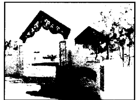
Pima Air Museum, Kino Community Hospital, Fairgrounds Neighborhood

For additional information and continuing updates, visit www.bondelection2004.pima.gov